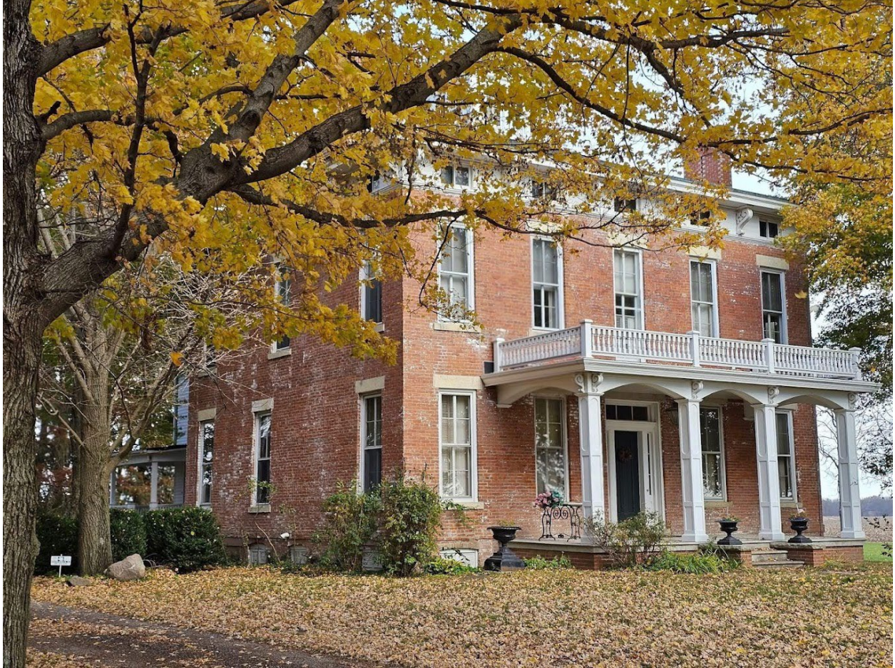
Figure 2 Woodbine Farmhouse Built in 1862